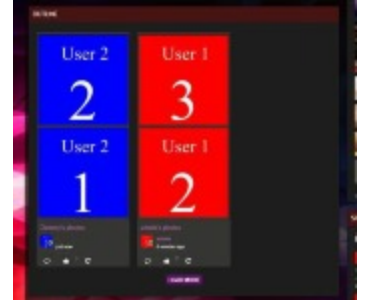
Photo 3 posted 12.30pm. Photo 1 has vanished.