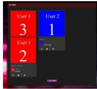
Photo1 posted at 10.10am