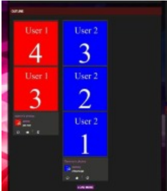
Photo 2 posted at 12.30pm but appears in same block as photo 1 posted over two hours before.